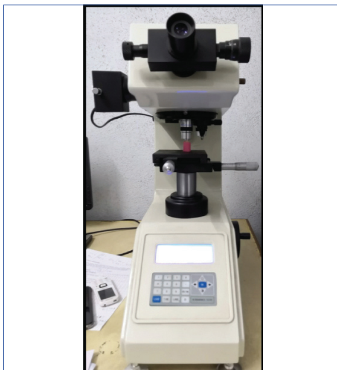
[Table/Fig-3]: Microhardness tester used for VHN with sample loaded on it.